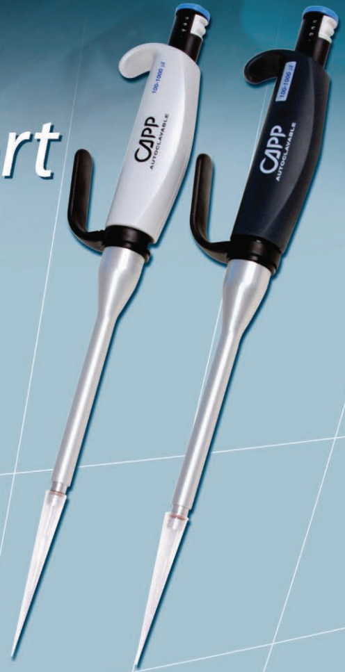
Comparison of thumb finger force requirements Manual Single Channel Pipettes 200ul

A major cause of repetitive strain injuries and user discomfort as a result of pipetting is an excessive workload of the thumb finger. The CappAero™ Comfort reduces the thumb workload up to about 70 % compared to other manual pipettes.